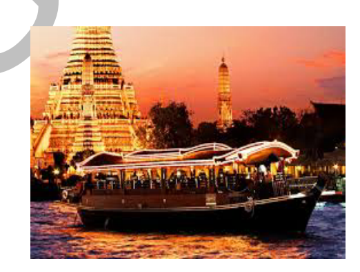
Day 2: BANGKOK CITY TOUR + SKY WALK + DINNER CRUISE